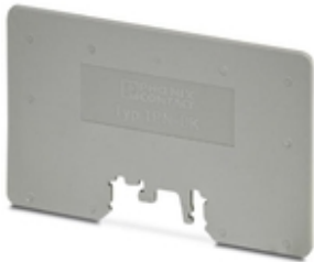
Partition plate, length: 110 mm, width: 2 mm, height: 69 mm, color: gray

Please be informed that the data shown in this PDF Document is generated from our Online Catalog. Please find the complete data in the user's documentation. Our General Terms of Use for Downloads are valid ( http://phoenixcontact.com/download )